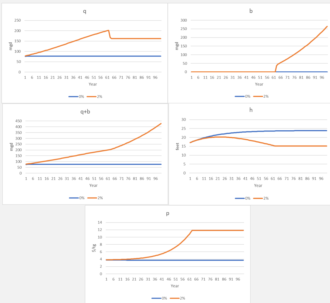
Figure 5: Optimal Trajectories for Groundwater Extraction, Desalination, Total Water Consumption, Efficiency Price, and Head Level for the Cases of 0 Percent and 2 Percent Annual Demand Growth